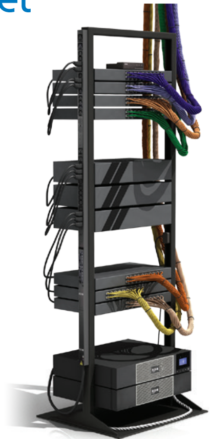
Network Closet Rack

While network closets take on all shapes and sizes, they are essentially an arm of the data center and as an important component of all mission-critical environments, must be organized, protected, and managed efficiently and effectively. IT professionals are charged with keeping the technology infrastructure functioning, even in the face of constrained resources and increasing complexity. By selecting the correct rack and power infrastructure, paired with management hardware and software, organizations can keep their businesses up and running. In this white paper, we go beyond simple how-to advice for keeping IT equipment operational, and discuss how efficiently managing, organizing, and operating network closets saves time, saves money, and avoids risk utilizing the existing space and equipment.