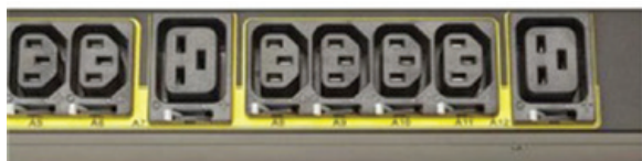
Figure 1. Rack PDUs with IEC outlet grips can reduce the risk of plugs getting bumped loose and leading to server shutdown.

In addition to cable management, power is also another component of rack hygiene, which is where UPSs and PDUs come in. To ensure maximum uptime and improve reliability, network closets should ideally contain redundant UPSs and PDUs to protect both primary and redundant equipment power supplies. However, not all network closets require fully redundant protection; by mixing and matching UPSs with PDUs, administrators can devise the right level of protection to suit their network closet needs. Typically, there are three levels of protection: