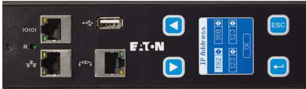
Figure 2. An advanced pixel LCD screen with pull-down interactive menu options on a rack PDU.

Of course, even the most agile environment is compromised if the prospect of downtime remains a persistent concern. Here, too, next-generation advanced-rack PDUs can have a significant impact. One drag on reliability is issues of IEC plug retention. It is not uncommon for plugs to get bumped loose in the rack, leading to server shutdown. A rack PDU with IEC plug retention prevents the accidental dislodgment of a plug and can greatly enhance reliability. There are several methods to secure the plug, but a solution integrated into the outlet is ideal to avoid the bulk of external clips or cable trays. It is also important to avoid solutions that require proprietary power cord solutions that involve additional expenses to the tune of 20-50%. On the other hand, an integrated IEC outlet grip reduces the total cost of ownership and improves reliability.