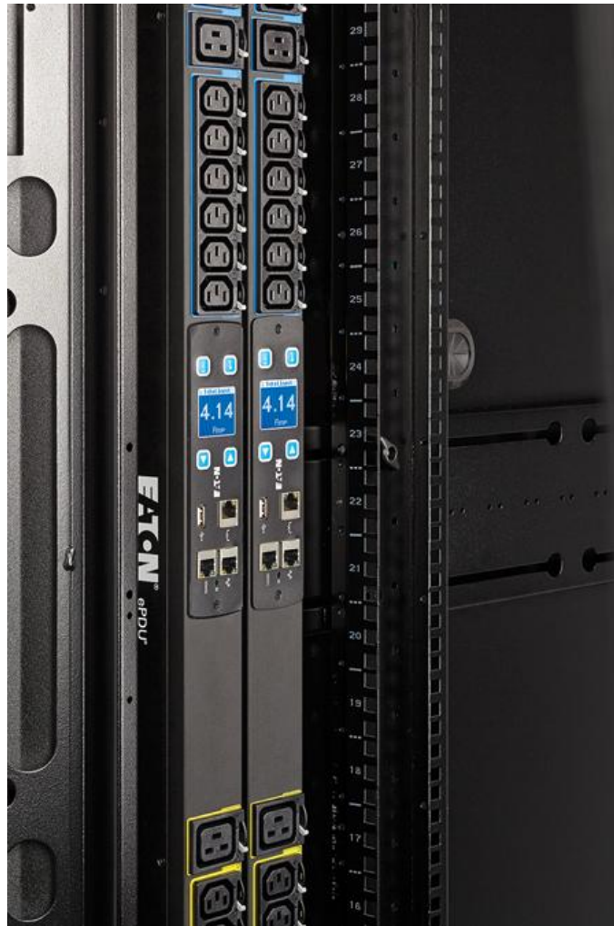
Figure 1. Rack PDUs with racks from the same vendor ensure compatibility, which enables agility in the data center.

The best way to facilitate agility: make sure a vendor can provide both the rack and the PDU. Compatibility goes a long way to ensure ease of use and optimize the way the two components work together.