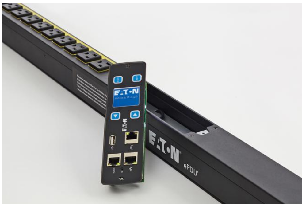
Figure 4. A hot-swap network meter card minimizes downtime on a rack PDU.

Meter accuracy on next-generation rack PDUs has improved to within \pm 1\% of actual value, which is known as billing grade accuracy. This is a significant improvement over legacy models, which primarily used meters for load balancing. With such a high level of accuracy, data centers are able to effectively measure power usage to all outlets, enabling department billing as well as the ability to track usage for local utility rebate programs. Billing grade accuracy may be especially important to co-located data centers, which can use these measurements for tenant power billing. In addition, the meter on next-generation rack PDUs can still be used for load balancing and helps data center operators identify open capacity.