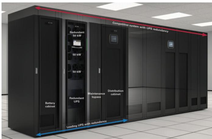
Figure 1. Modular UPSs save money and floor space by enabling data centers to "grow vertically" (reducing horizontal sprawl as shown above) and leverage internal redundancy, rather than install backup units.