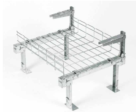
Self-supporting cable management system

The tray system should be flexible enough to be adjusted on site to avoid the many unforeseen obstructions under the raised floor such as chilled water pipe. As a rule of thumb, changes in the vertical height of the tray should be limited to a one inch change in vertical per one foot of horizontal.